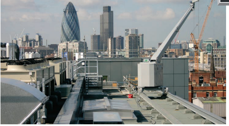
A Bilco Type D-50 aluminum roof access hatch can be seen in the mid-ground on the roof of the new Pathology and Pharmacy building at Barts & London NHS Trust in Whitechapel, London.

Staff working at Barts and The London NHS Trust's new Pathology and Pharmacy building are now finding it easier to move equipment in and out thanks to the installation of roof access hatches.