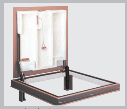
JFR one hour fire door